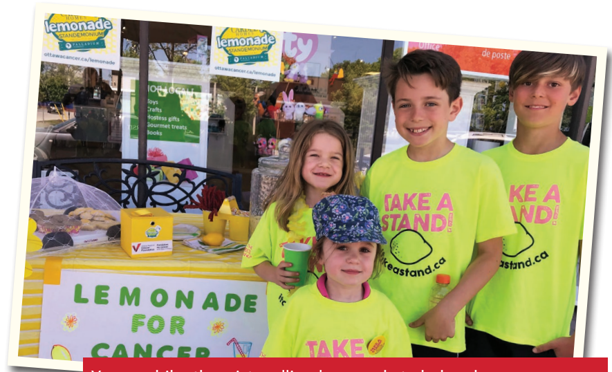
Young philanthropists selling lemonade to help advance cancer research through the Cancer Foundation's 2018 Cardel Homes Lemonade Standemonium presented by Palladium Insurance.

Your dollars at work in our community in 2017-2018