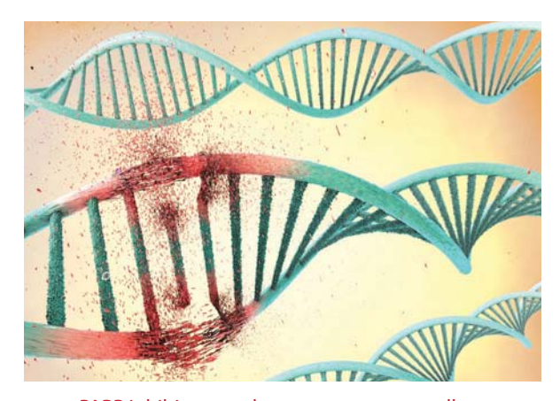
PARP inhibitors work to prevent cancer cells from repairing their DNA.

In some cases, women have been using these treatments for years with no cancer progression!